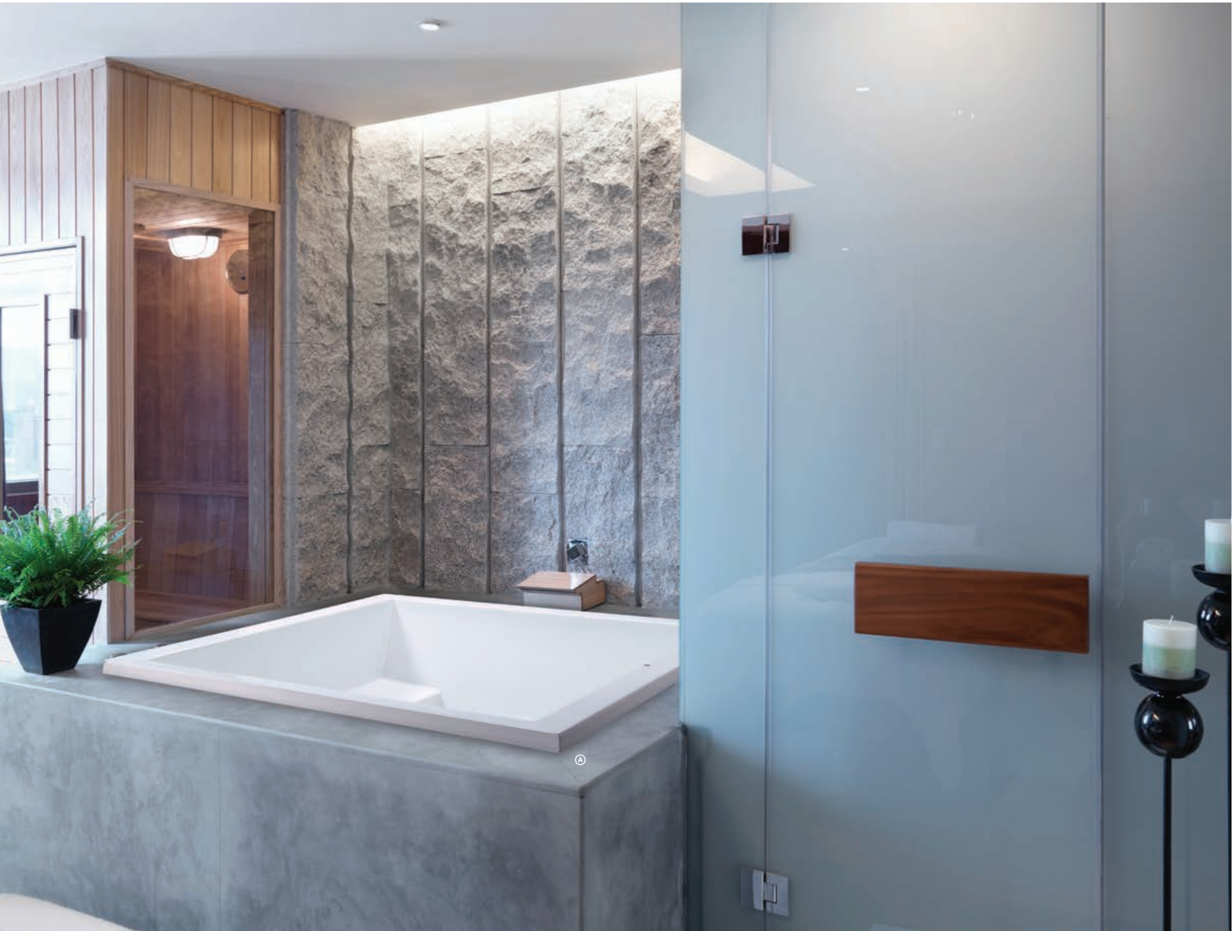
Ⓐ KALIA SOAKING BATH