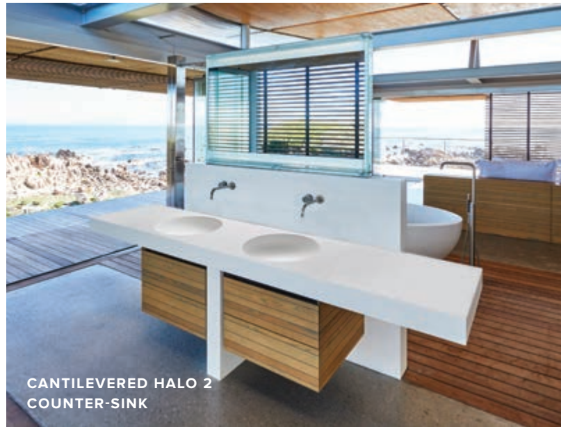
CANTILEVERED HALO 2 COUNTER-SINK