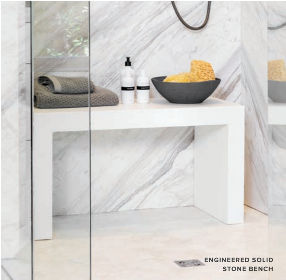
ENGINEERED SOLID STONE BENCH