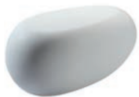
ESS PEBBLE TABLE