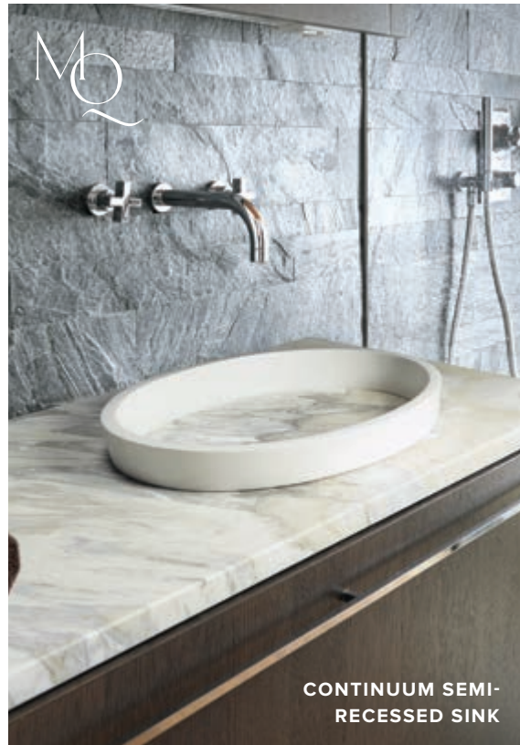
CONTINUUM SEMI- RECESSED SINK

⊛ AWARDED 2015 Interior Design Best of Year 2016 Good Design Award 2017 German Design Award