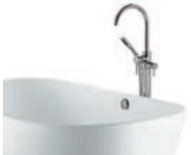
FREESTANDING TUB FILLER