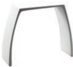
ESS BATH TABLE

MTI does a masterful job at using its ingenuity to apply its materials and techniques to other products for the bathroom. For beauty and convenience.