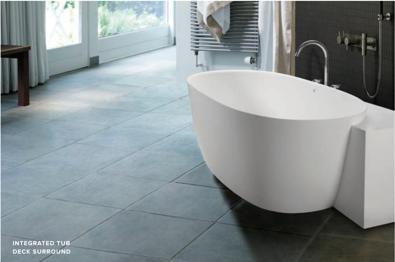
INTEGRATED TUB DECK SURROUND