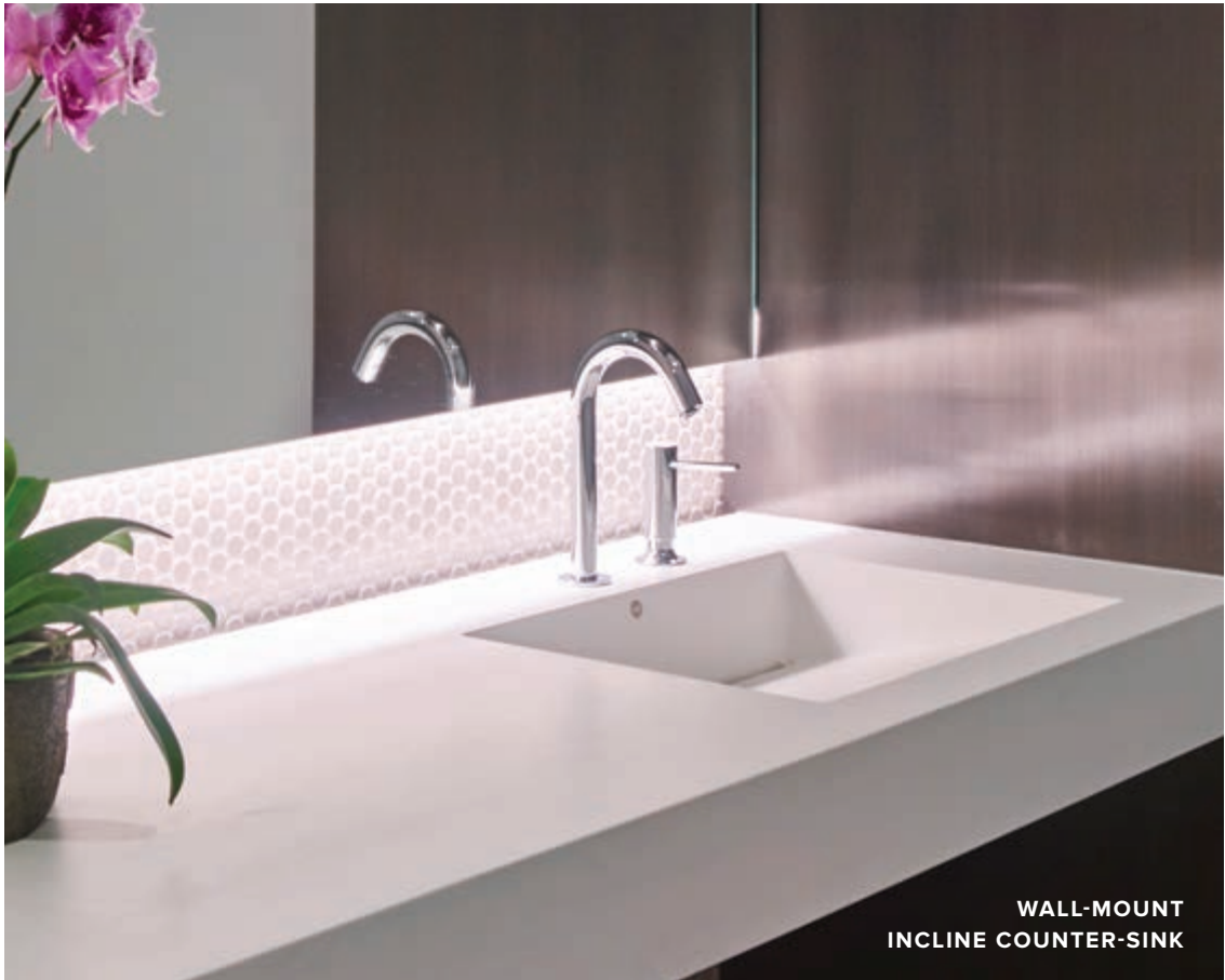
WALL-MOUNT INCLINE COUNTER-SINK