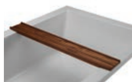
TEAK TUB TRAY