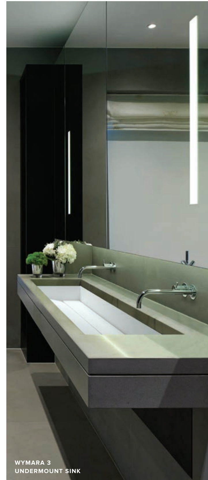
WYMARA 3 UNDERMOUNT SINK