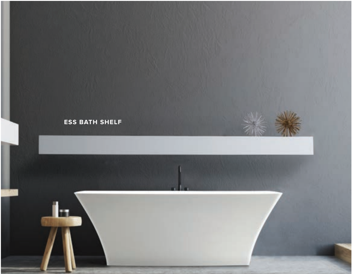
ESS BATH SHELF