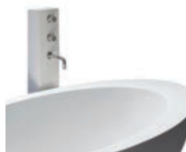
ESS FAUCET STAND