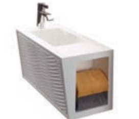
WALL-MOUNTED MICRO VANITY SINK