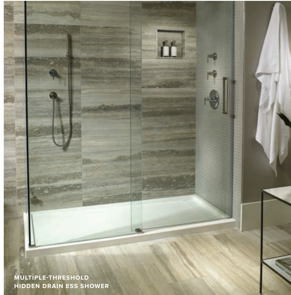
MULTIPLE-THRESHOLD HIDDEN DRAIN ESS SHOWER

⊛ AWARDED 2015 Interior Design Best of Year 2016 Good Design Award 2017 German Design Award